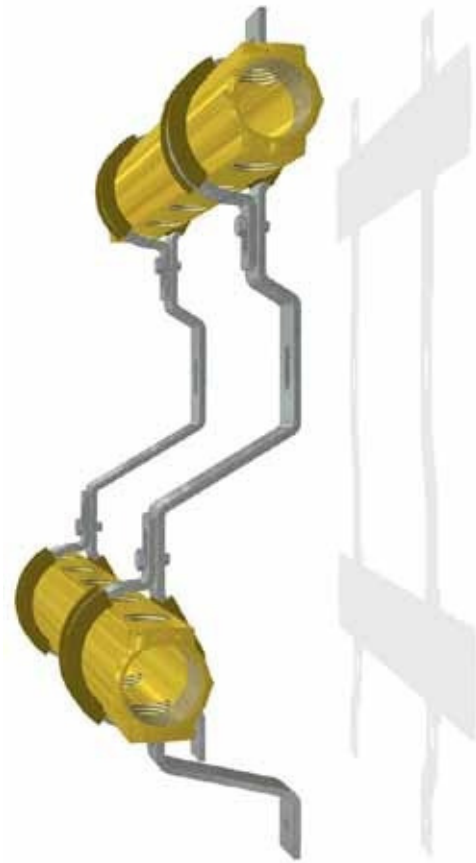
Manifold 1 ¼"

- Balancing valves can also be installed in the return and the return valve cartridge on the supply. This is utilized when 24 volt powerheads are requested with # 6025 flowmeter installed on the return.