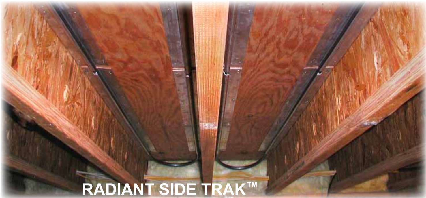
RADIANT SIDE TRAK™ (Radiant heating or cooling panel)

provides an alternative method of installation which conforms to the natural ellipse of the PE-RT or PEX tube deployed under the subfloor.